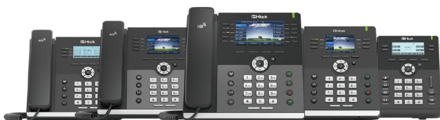
UC903 UC924/UC924E UC926/UC926E UC923 UC912/UC912E/UC912G

A: All UC900 series models, except UC902(P) .